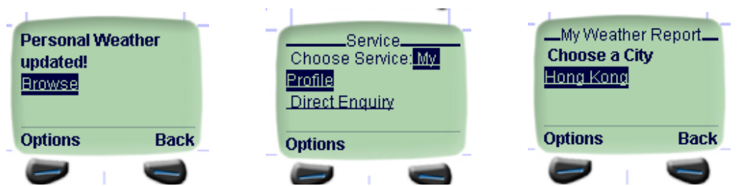
Figure 5. The weather information requested by the user in the spoken dialog interaction is ultimately pushed to his WAP phone as shown in the three screen dumps above.

Screen dumps in Figure 5 shows the new weather information pushed to the user. When the user clicks on "My Profile" (central screen-dump in Figure 5), he is connected to the city selected previously during the spoken dialog interaction, i.e. "Hong Kong".