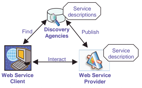
Figure 1. The Service-oriented architecture of Web services [6].

Figure 1 depicts the Web service architecture that involves a Web service provider, Web service client and discovery agencies. The Web service provider executes and hosts access to the services. This is achieved via a WSDL<sup>2</sup> service description [7] that publishes the service with its API<sup>3</sup> to discovery agencies. The exposed API facilitates interoperability by allowing Web service clients to invoke other Web services at runtime. Through these discovery agencies, a Web services client can find the Web services that it needs. Web services can interact with one another by means of SOAP<sup>4</sup> [8], which acts as the messaging protocol to transport XML data.