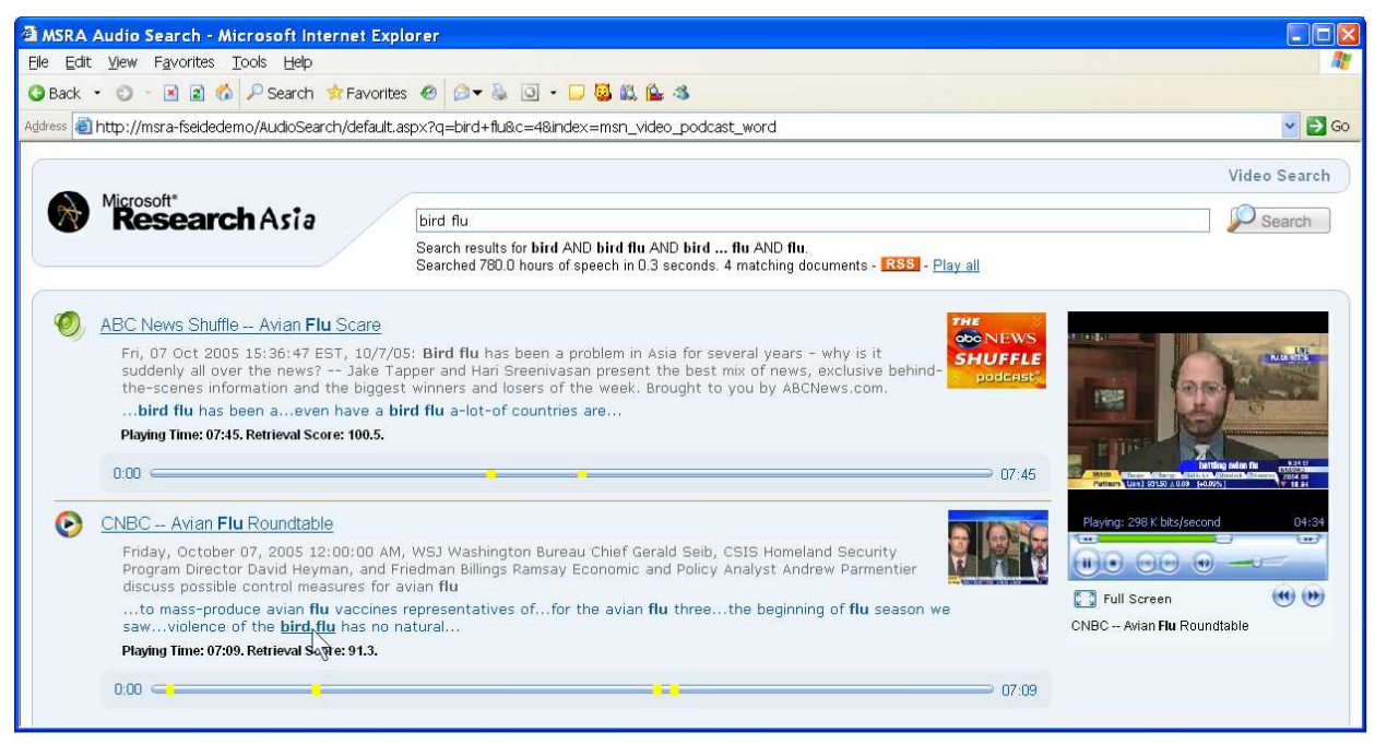
Figure 3: Screenshot of the video/audio-search prototype. For each document, in addition to the title and description text from meta-data, the system displays recognition-transcript snippets around the audio hits, e.g. "... bird flu has been a ..." in the first document. Clicking on a word in a snippet starts playing back the video at that position using the embedded video player.

represent important lattice properties – recognition alternates with scores, time boundaries, and phrase-matching constraints – in a form suitable for large-scale web-search engines, while requiring only limited code changes.